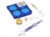
Sample Filtration Kit