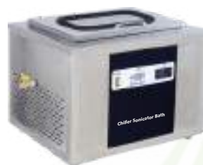
Ultrasonic Bath with Chiller