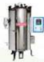
Fully Automatic Autoclave