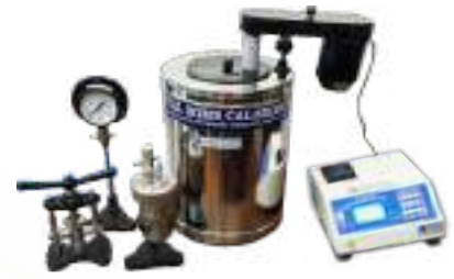
Automatic Bomb Calorimeter