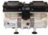
Oil Free Vacuum Pump