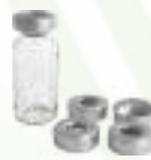
20mm Aluminum, PTFE Crimp Caps