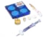
Sample Filtration Kit