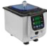
Thermostatic Water Bath