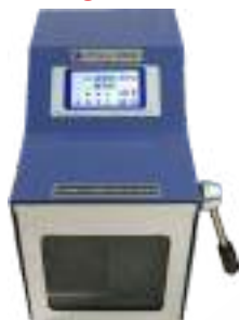
Stomacher Blender / Paddle Bag Mixer