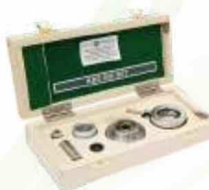
KBr Die Set for Pallet Making Sizes 3mm to 75mm available