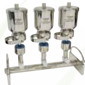
Sterility Testing Manifold (3 Branch & 6 Branch)