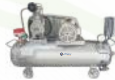
Oil Free Air Compressor