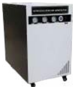
Nitrogen Gas Generator & Nitrogen Plant