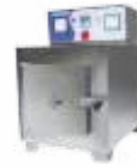
Muffle Furnace (High Temp.)