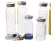
20 ml Headspace GC Vials