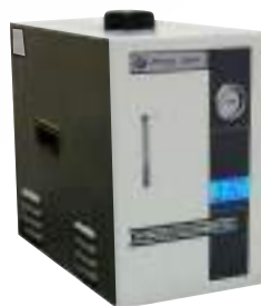
Hydrogen Gas Generator