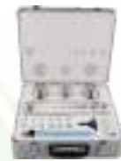
F1, F2, E1, E2 Class Weight Set