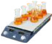
Multi Position Magnetic Stirrer