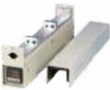
HPLC Column Oven