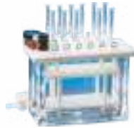
12 & 24 Port Sample Processing Manifold