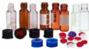
Screw Caps Vials, Septas & Caps