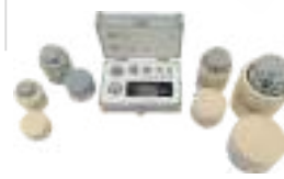
Laboratory Weight Box