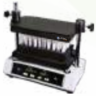
Multi Tube Vortexer