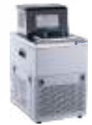
Constant Temperature Water Bath with Digital Control