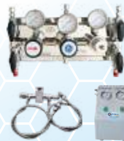
Auto Gas Change Over / Mechanical-Auto Gas Change Over