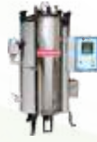
Fully Automatic Autoclave