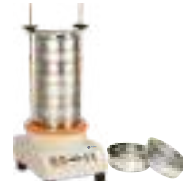
Electromagnetic Sieve Shaker