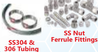
SS304 & 306 Tubing SS Nut Ferrule Fittings