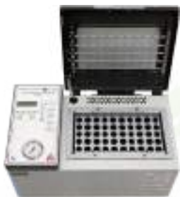
Nitrogen Evaporator 50, 25, 08 Samples