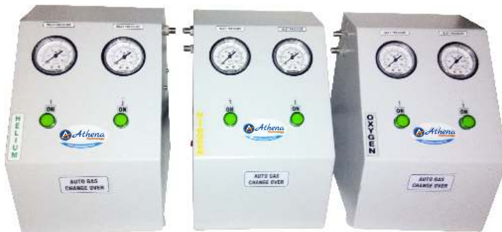
Automatic Gas Changeover