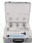
F1, F2, E1, E2 Class Weight Set