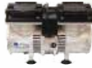
Oil Free Vacuum Pump