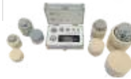
Laboratory Weight Box