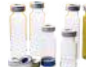
20 ml Headspace GC Vials