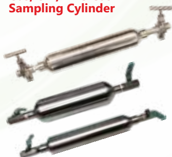
Gas, Oil / LPG Gas Sampling Cylinder