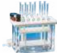
12 & 24 Port Sample Processing Manifold