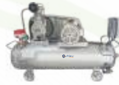
Oil Free Air Compressor