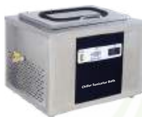
Ultrasonic Bath with Chiller