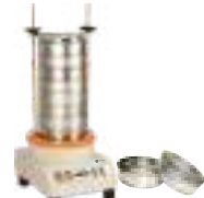
Electromagnetic Sieve Shaker