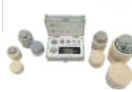
Laboratory Weight Box