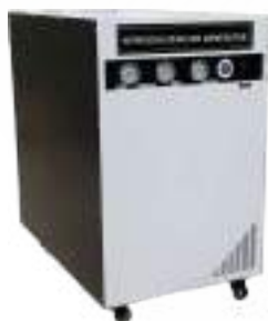
Nitrogen Gas Generator & Nitrogen Plant