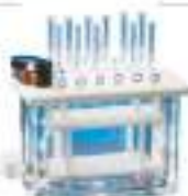
12 & 24 Port Sample Processing Manifold