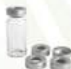
20mm Aluminum, PTFE Crimp Caps