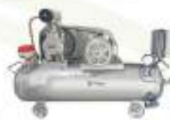
Oil Free Air Compressor