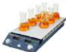
Multi Position Magnetic Stirrer