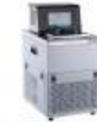
Constant Temperature Water Bath with Digital Control