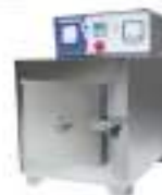
Muffle Furnace (High Temp.)