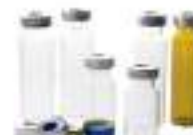
20 ml Headspace GC Vials