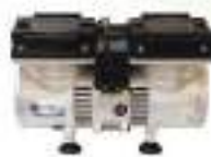
Oil Free Vacuum Pump