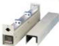
HPLC Column Oven