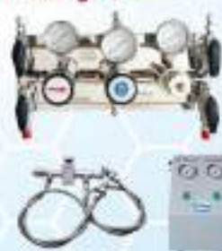
Auto Gas Change Over / Mechanical-Auto Gas Change Over