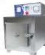
Muffle Furnace (High Temp.)