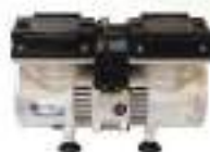
Oil Free Vacuum Pump