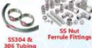
SS304 & 306 Tubing