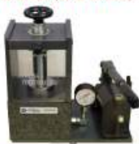
Manual Hydraulic Press for FTIR & XRF (15 to 40 tons)