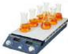
Multi Position Magnetic Stirrer