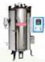
Fully Automatic Autoclave