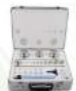
F1, F2, E1, E2 Class Weight Set