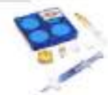
Sample Filtration Kit