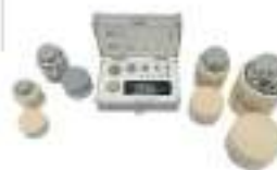
Laboratory Weight Box