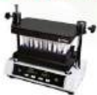
Multi Tube Vortexer