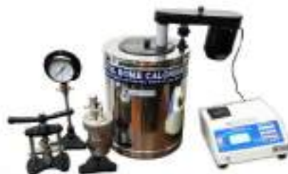
Automatic Bomb Calorimeter