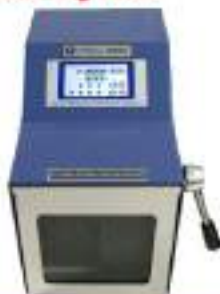
Stomacher Blender / Paddle Bag Mixer