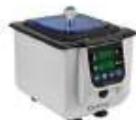
Thermostatic Water Bath