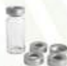
20mm Aluminum, PTFE Crimp Caps