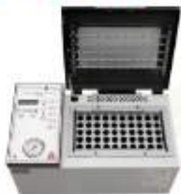
Nitrogen Evaporator 50, 25, 08 Samples