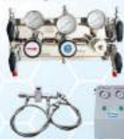
Auto Gas Change Over / Mechanical-Auto Gas Change Over