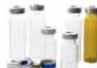
20 ml Headspace GC Vials