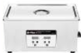
Multifunctional Ultrasonic Cleaner