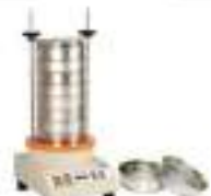
Electromagnetic Sieve Shaker