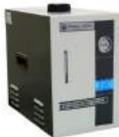
Hydrogen Gas Generator