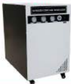
Nitrogen Gas Generator & Nitrogen Plant