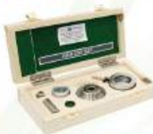
KBr Die Set for Pallet Making Sizes 3mm to 75mm available