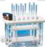
12 & 24 Port Sample Processing Manifold