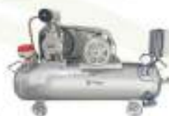
Oil Free Air Compressor