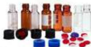
Screw Caps Vials, Septas & Caps