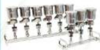
Sterility Testing Manifold (3 Branch & 6 Branch)