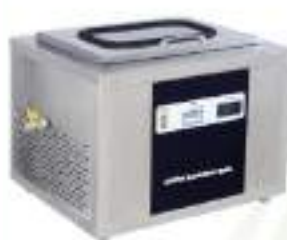
Ultrasonic Bath with Chiller