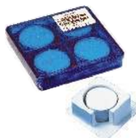
Nylon 66 Membrane Filter Size: Ø 13 x 0.2 µ (Porosity)