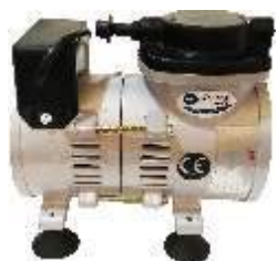
Vacuum Pump for above Model ATH-15 Max. Flow - 15 LPM, Vacuum - 22" Hg (554 mm) Max. Pressure - 25 Psig, 1/20 HP