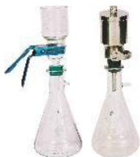
Solvent Filtrations Assembly Glass / SS (upper part) with 1 lit. Bottom Flask Glass Size 47mm

It used to filter the Solvent (mobile phase) for HPLC & other analytical application. Upper part is of Glass or SS as per requirement.