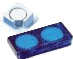
Nylon 66 Membrane Filter Ø47mm x 0.45µ other sizes & porosity (like 0.2µ) also available

It used to filter the Solvent (mobile phase) for HPLC & other analytical application. Upper part is of Glass or SS as per requirement.