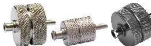
Ø 13mm S. S. Filter Holder / Ø 13mm P. P. Filter Holder