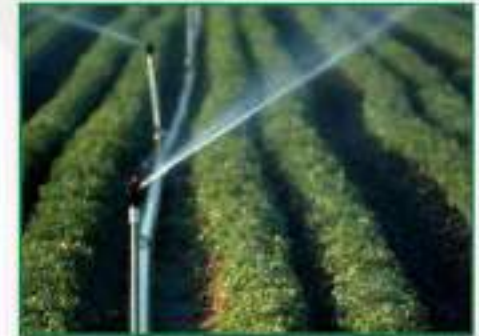
Hydrogen Agricultural Irrigation