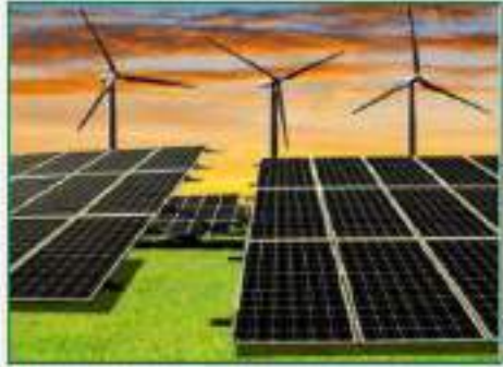
Hydrogen Fuel Station by Renewable Energy