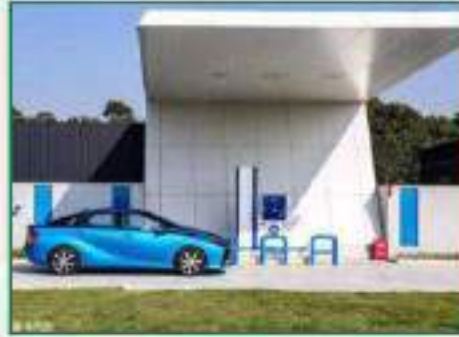
Hydrogen Fueling Station for Hydrogen Fuel Cell Car or Bus