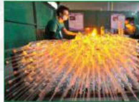
Glass Processing Industry