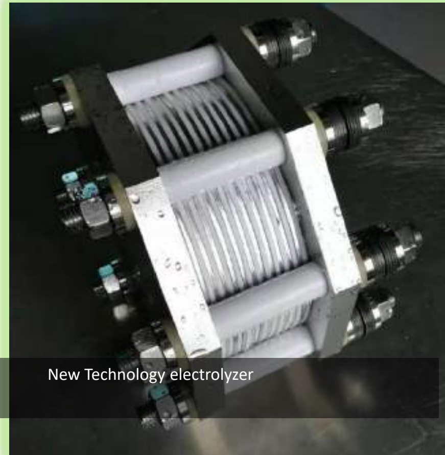
New Technology electrolyzer