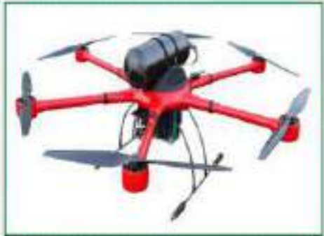
Hydrogen Fueling Station for Hydrogen Fuel Cell Drone