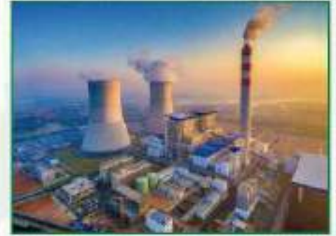
Power Plant Industry