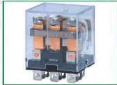
Electric Appliance Manufacture